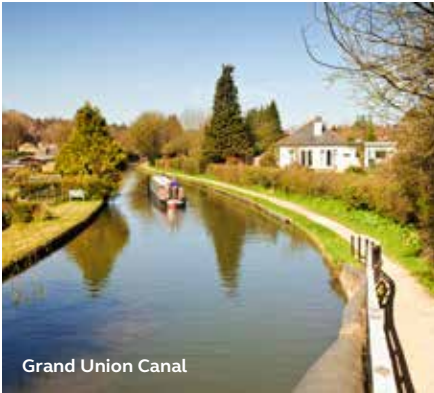
Grand Union Canal