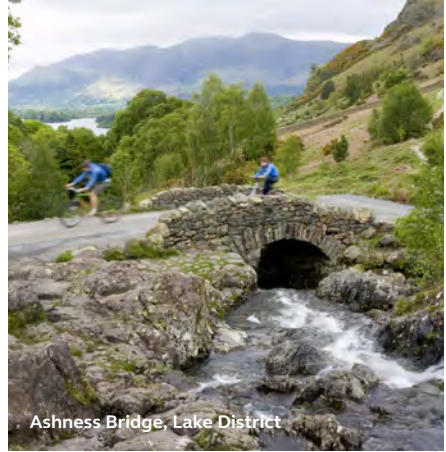
Ashness Bridge, Lake District

There's an excellent new footpath around Ullswater and a dog walk from site on forest tracks to the village of Dockray, where you can visit the Royal Inn for a spot of lunch or a drink.