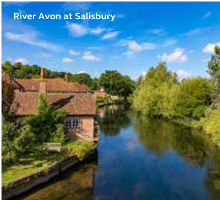
River Avon at Salisbury