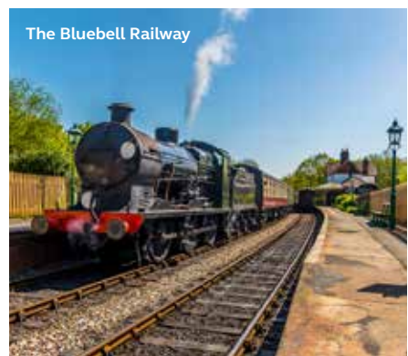
The Bluebell Railway