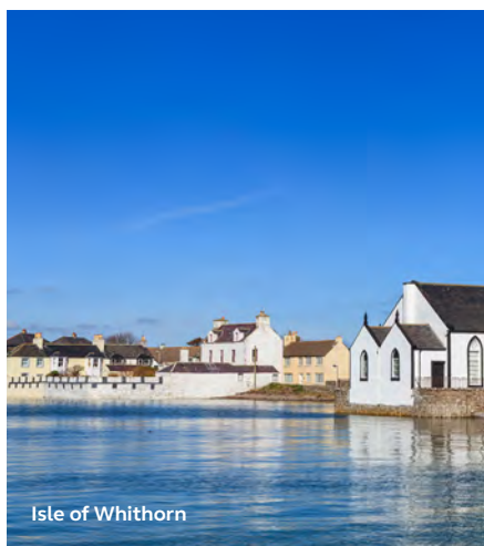
Isle of Whithorn