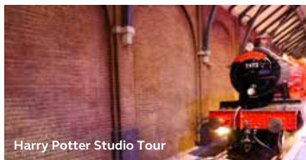
Harry Potter Studio Tour

Don't forget to check your Great Saving Guide for all the latest offers on attractions throughout the UK. camc.com/greatsavingsguide