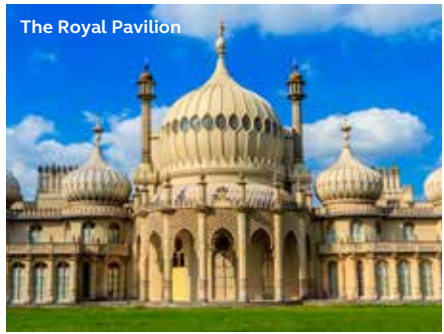
The Royal Pavilion