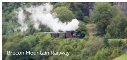
Brecon Mountain Railway

Don't forget to check your Great Saving Guide for all the latest offers on attractions throughout the UK. camc.com/greatsavingsguide